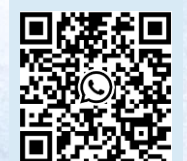
ISETS Group whatsApp group