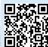
YouTube Channel @isets2020